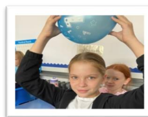
Investigating static electricity

Science and its practical application in healthcare and industry is central to our economic future, for our health and wellbeing as individuals and as a society. Through learning in the sciences, children and young people develop their interest in, and understanding of, the living, material and physical world. In Bankhead Primary the children engage in a wide range of collaborative investigative tasks, which enables them to develop important skills to become creative, inventive and enterprising adults in a world where the skills and knowledge of the sciences are needed across all sectors of the economy.