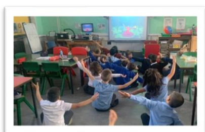
We love yoga!

Learning in health and wellbeing ensures that children and young people develop the knowledge, understanding and skills which they need now and in the future to help them with their physical, emotional and social wellbeing. We are developing our Restorative Practice approaches to