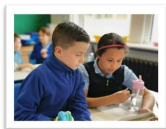
Learning about UNCRC

Our three school values and rules provide guidelines for good behaviour for everyone in our school. The Pupil Councils, Circle Time and School/Class suggestion boxes encourage pupils to discuss a wide range of issues and find practical solutions to any problems. Anti-bullying week at the beginning of each session and anti-bullying leaflets for parents and pupils help everyone develop consistent anti-bullying strategies. P7 pupils are trained as peer mediators and work on a rota basis in our P4-7 playground helping pupils' resolve their playground disputes.