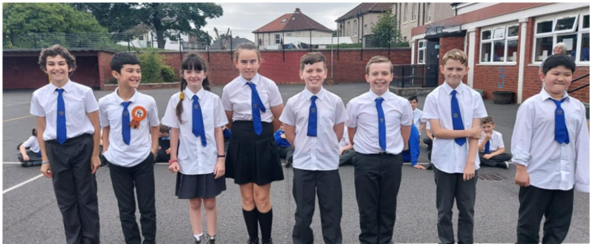
P7 House Captains

Pupil voice is an essential vehicle for creating a positive learning climate. Within our school we promote pupil participation and active voice in a range of ways. We have an active Pupil Council, Rights Group, Learning Committee, Sports, ECO, Health and Wellbeing, Road Safety, House Captains and Vice Captains. This gives children the opportunity to promote 'pupil voice' in different ways, shape improvement and learn valuable skills for life and work.