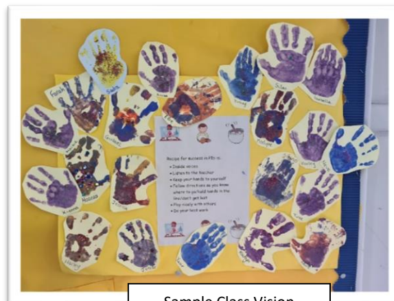
Sample Class Vision

Our Vision and Values underpin all we do and link closely to the Children's Rights as outlined by Education Services http://www.glasgow.gov.uk/childrensrights .