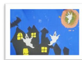
P3 Hallowe'en Art

The inspiration and power of the arts play a vital role in enabling our children and young people to enhance their creative talent and develop their artistic skills. Children learn skills in Art, Craft, Drama, Movement, PE, Dance and Music. Children are encouraged to develop their own talents within these subjects.) The children share their learning through concerts, class and whole school assemblies and whole school shows.